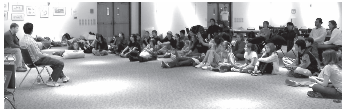
University of New Mexico students showed slides and talked to J505 convention attendees about their recent trip to Israel.